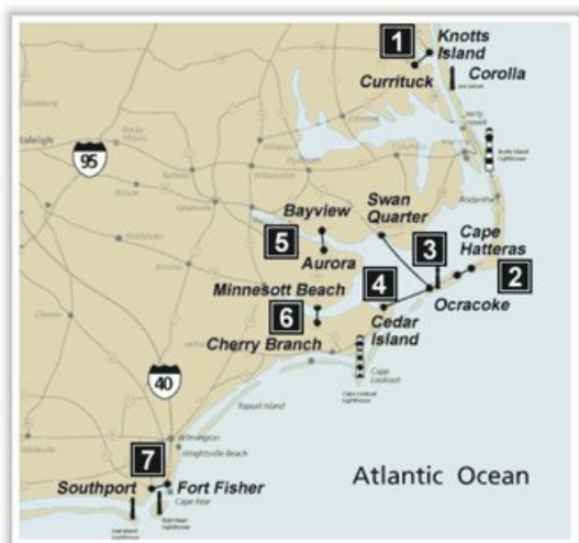
Figure 21. State-owned Ferry Service

North Carolina Department of Transportation.