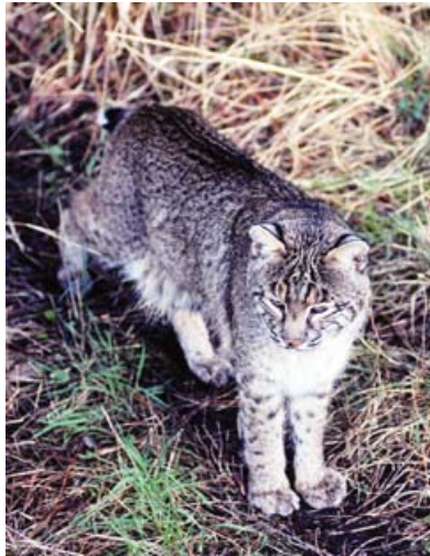
Bobcats are solitary except during breeding season. being about one third larger than females.

The bobcat gets its name from its short tail (about 5 inches long) that is dark above and white below, coloring that may serve a signaling function. The bobcat's fur is short, dense and soft and is light brown to reddish brown on the back. The underside and insides of the legs are white with dark spots or bars. The fur down the middle of the back may be darker, and bobcats may be grayer in the winter than at other times of the year. Adult bobcats are about two times as large as a domestic cat, standing 20 inches to 30 inches at the shoulder. Adult weights range from 10 to 40 pounds, with males