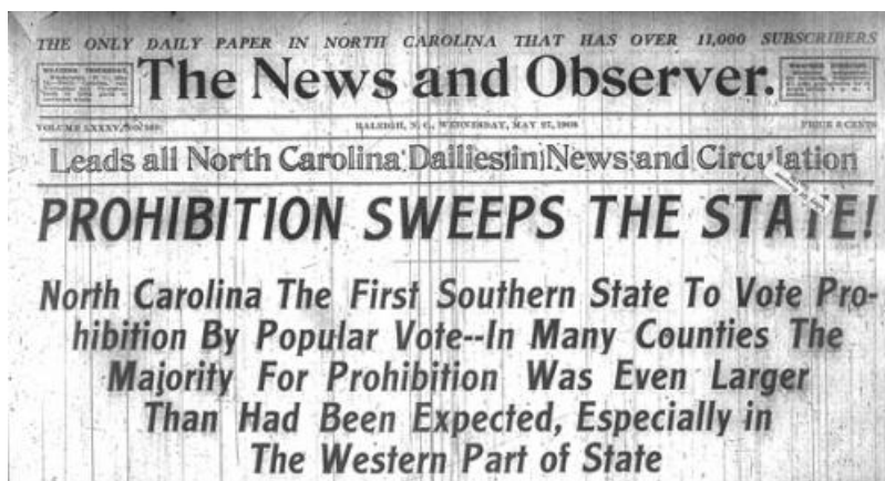
News and Observer (Raleigh, N.C.), 27 May 1908. North Carolina Collection. Accessed via LearnNC.

The temperance movement in North Carolina [2] , as elsewhere in the country, painted a bleak picture of alcohol's influence on society. All manner of social ills were attributed to the consumption of alcohol, including disease, crime, poverty, physical weakness, dishonesty, and the orphaning of children. Saloons, most of which were run by large breweries, proliferated during the last half of the nineteenth century. Breweries pushed the number of saloons ever higher in an effort to starve out competitors; in some communities, the number grew to one saloon for every one hundred-fifty to two hundred people. Because this density was not sustainable by beer and other alcohol alone, saloon keepers sometimes offered other illegal activities to lure customers, including prostitution, gambling, and cock-fighting.