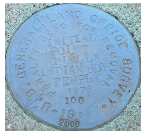
A 2012 photograph of the survey marker for the Qualla Boundary.