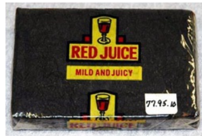
Photograph of a package of T. F. Williamson's Red Juice Chewing Tobacco.