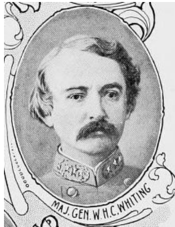
Image of William Henry Chase Whiting, from Internet Archive 1901, [p. opposite title page], published in 1901 by Raleigh, E.M. Uzzell, printer. Presented on

William Henry Chase Whiting, Confederate general and defender of Wilmington [2] , a descendant of prominent seventeenth-century English settlers in Massachusetts, was born in Biloxi, Miss., the son of Levi, an officer in the regular army, and Mary A. Whiting, both natives of Massachusetts. Intellectually gifted, he was graduated at the head of his class from the Boston Public School, Georgetown College [3] (1840) where he completed the four-year course in two, and West Point where he was top man in the class of 1845. It is said that his academic record at the U.S. Military Academy was not