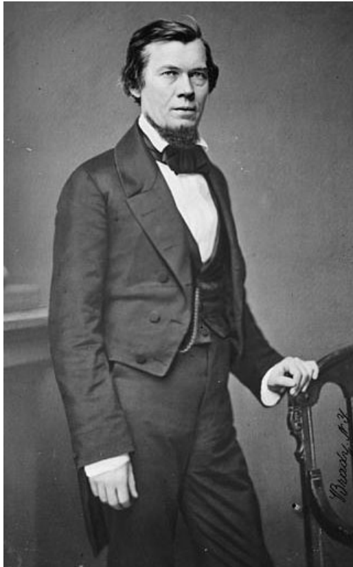
"Hon. Jacob Thompson of Miss." Presented on siblings eventually moved to that state.