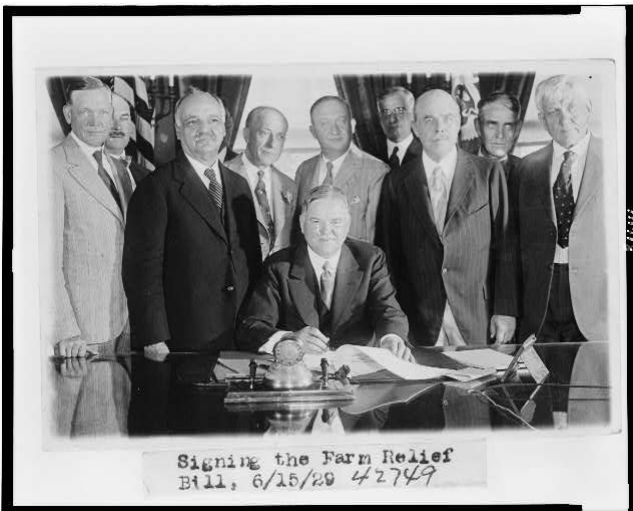
"Herbert Hoover signing the Farm Relief Bill, with nine other men standing alongside and behind him." June 15, 1929.

While the federal government under President Herbert Hoover's [9] administration attempted to provide some work and financial relief, the effects of the Depression nonetheless worsened from 1929 to 1932. Clearly, more drastic measures were required to avert further tragedy. Amidst these circumstances Franklin D. Roosevelt [10] was elected president in 1932, and with his inauguration the New Deal [11] was launched in 1933.