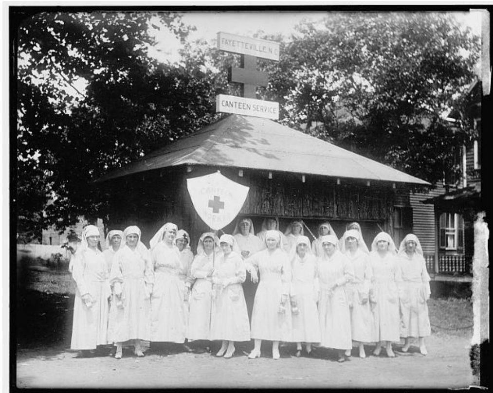
Fayetteville, N.C. Canteen Service. [Date created/published between 1910-1920]. American People"

See also: Great Depression [2] ; Public Schools in the Great Depression [3] ; 1920's [4] ; Agriculture During the Great Depression [5]