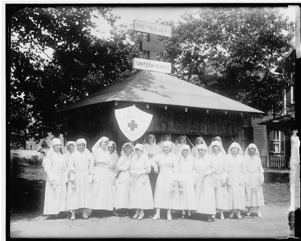
Fayetteville, N.C. Canteen Service. [Date created/published between 1910-1920].

See also: Great Depression [2] ; Public Schools in the Great Depression [3] ; 1920's [4] ; Agriculture During the Great Depression [5]