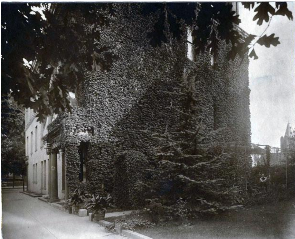
Photograph of the Olivia Raney Library, circa 1900. Item H.19XX.488.9, from the collections of the North Carolina Museum of History. [3]and vice-president and director of the Standard Gas and Electric Company.