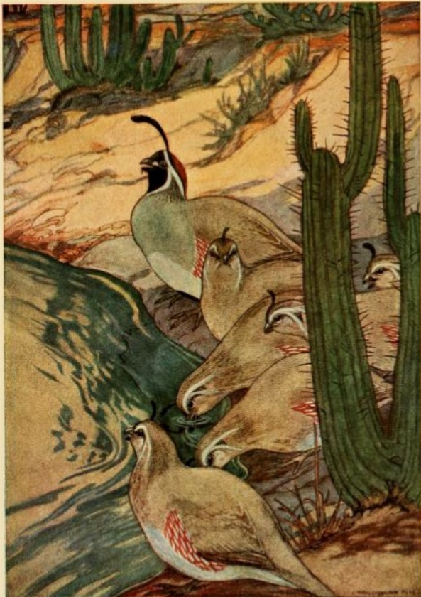
The Quail of Mesquite Canyon