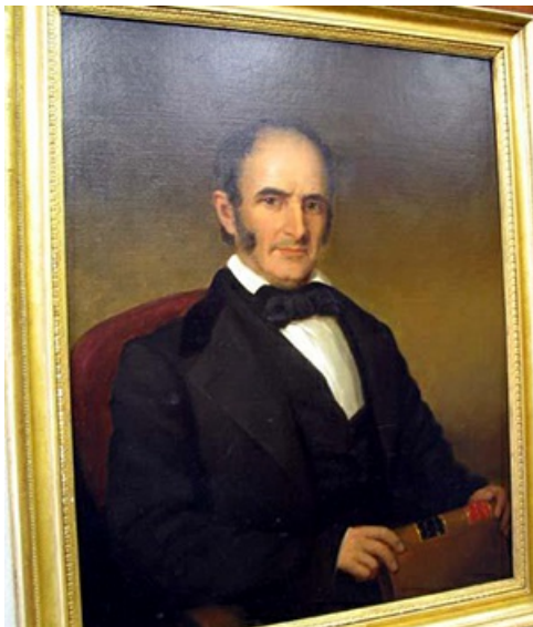
A portrait of Richmond Mumford Pearson by William Garl Browne, 1892.

During the Civil War [30] , his decisions in exemption and habeas corpus cases raised storms of protest in North Carolina and throughout the South. Time after time, he asserted the rights of the individual and the sanctity of contract over the dictates of military necessity, holding that the conscription [31] laws of 1862 had exempted those engaged in certain occupations and had provided to all men the clear option of furnishing able-bodied substitutes in lieu of military service. Confederate authorities, he argued, had no right to violate and abrogate these laws. Over and over again he issued the writ of habeas corpus when men seeking release from military service applied to him for exemption from conscription. The interpretation of conscription and exemption laws occupied much time of the justices, both while court was in recess and in full session. Pearson's colleagues tended to side with him in the early months of the war but the tide shifted as time passed. In 1864, when the Confederacy suspended the writ of habeas corpus, Pearson refused to uphold the suspension and continued his practice of releasing many individuals who applied to him for relief.