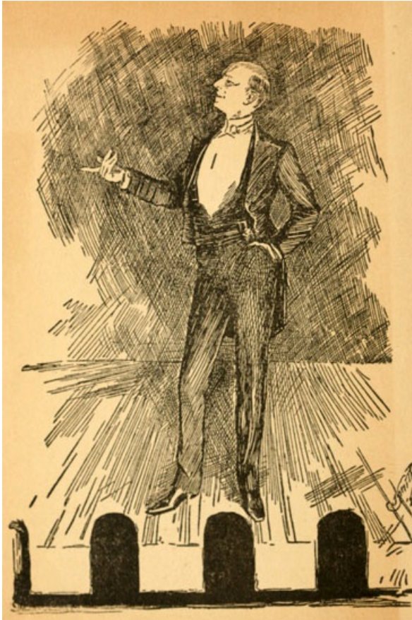
Illustration of Edgar Willson (Bill) Nye from Bill Nye's Red Book , published 1906 by Thompson & Thomas,

Bill Nye first visited the Asheville area in 1886 and was impressed with the scenery and climate, writing: "You will find