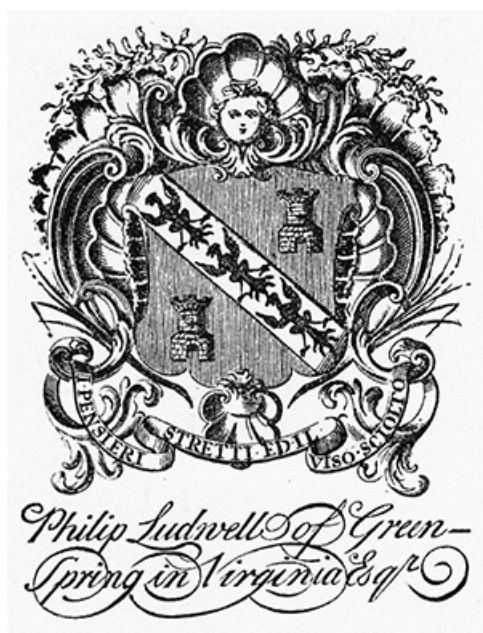
Bookplate of Philip Ludwell featuring his coat of arms.

Ludwell organized his government in North Carolina in the spring of 1690. His right to office was challenged immediately by one John Gibbs [10] , a Virginian who had gone to North Carolina, acquired land, and proclaimed himself governor about the time of Sothel's expulsion. Gibbs claimed that Ludwell's appointment was invalid, apparently basing his claim on the Fundamental Constitutions [11] of Carolina, which restricted the governorship of the Carolina colonies to resident Proprietors, heirs apparent of Proprietors, and members of the Carolina nobility [12] (in which the ranks were landgrave and cacique). Gibbs, a relative of one of the Proprietors, had been made a cacique of Carolina in 1682, but he had settled in Virginia instead of Carolina. On the departure of Sothel, a Proprietor, there was no one in North Carolina qualified for the governorship under the Fundamental Constitutions, which no doubt prompted Gibbs's move to that colony. As Ludwell had sold his wife's proprietorship, he had no claim to the governorship other than his commission from the Proprietors, who either did not know of Gibbs's action or chose to ignore it.