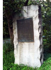
Image of Thomas Lloyd Memorial in Orange County, North Carolina.