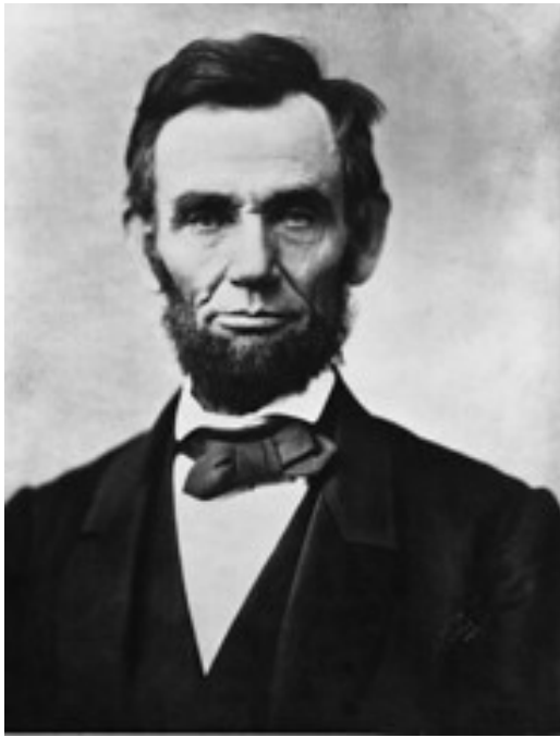
Photo taken November 8, 1863 and posted April 6, 2008"Abraham Lincoln- head & shoulders portrait."