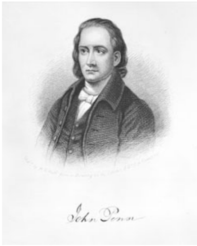
John Penn. Call no. N_66_3_104.