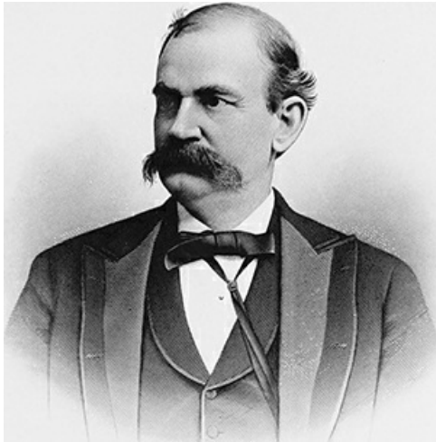
Engraving of Wharton Jackson Green, circa 1905.