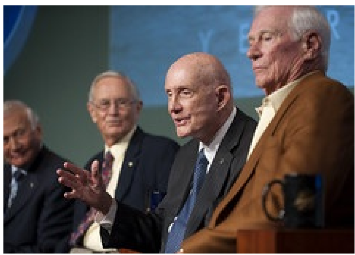
" Apollo 40th Anniversary Conference." July 20, 2009. [2] Barely a half century after the Wright brothers' first flight [3], people were flying in outer space. Numerous North Carolinians have played important roles in this ongoing effort to explore the "final frontier."