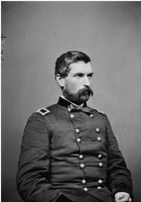
John Gibbon.