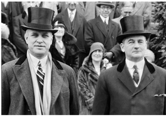
North Carolina governors O. Max Gardner and Angus W. McLean at Gardner's inauguration, 1929.

[21] As governor, he was compelled to deal with serious labor unrest. In 1929, it hit the textile towns of Gastonia and Marion. In Gastonia Communist labor organizers were involved. In both cases, violence erupted, people were killed, and local justice was found wanting. Gardner's actions during these crises, however, won national praise. He called out the National Guard [22] and attempted to see that justice was done in the courts. He expressed a lack of sympathy for communism [23] , but insisted that Communists had the right of protection under the law. He attacked doctrinaire employers, criticized long hours in textile plants, and stated that "we cannot build a prosperous citizenship on low wages."