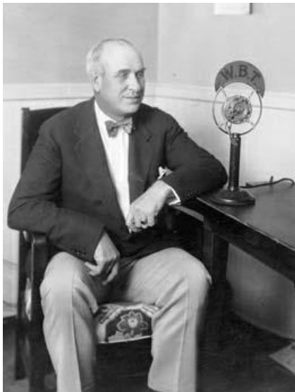
Oliver Maxwell Gardner giving a radio address on WBT radio, 1929-1933.

In the presidential campaign of 1932, Gardner supported Franklin D. Roosevelt, with whom he had become acquainted as a fellow governor, and during the 1930s North Carolina had considerable influence on the national government. In 1933, Gardner opened a law firm in Washington and was admitted to practice before the Supreme Court. A specialist in tax matters, he soon became an effective lobbyist for numerous organizations such as the Cotton Textile Institute, the Rayon Producers Group, and Coca-Cola. Generally he supported the New Deal and approved its legislation regarding hours, wages, working conditions, and collective bargaining. Roosevelt frequently called upon him for advice and for help in writing speeches, and Gardner occasionally carried out semiofficial chores such as negotiating the government's air mail contract. However, he opposed the plan for reconstituting the Supreme Court and was so disturbed by Roosevelt's attempts to defeat senators Walter George, Ellison D. Smith, and Millard Tydings in the primaries of 1938 that he quietly helped organize Senator George's campaign to retain his senatorial seat.