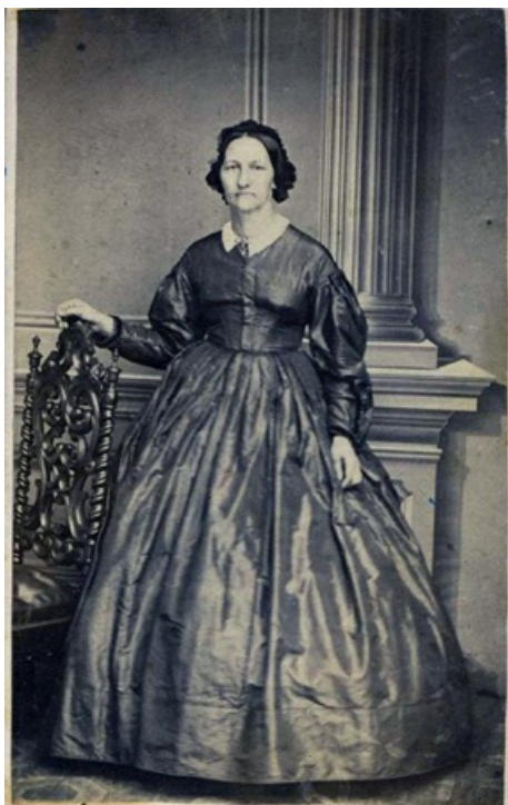
Photographic portrait of Eliza McCardle Johnson, wife of President Andrew Johnson, made circa 1870-1890.

Virtually unknown nationally outside the House, Johnson was too well known in Tennessee, where Democrats wearied of his sinecure and Whigs [10] "Henry-mandered" his district. He was on Golgotha. "My political garments have been divided and upon my vesture do they intend to cast lots"—a gloomy forecast for a decade which saw him in statehouse and Senate. Elected governor in 1853 and again in 1855, he vanquished such orators as the Whig Gustavus A. Henry and the "apostate" Meredith P. Gentry; in each close race he lost East Tennessee and won via the rural Middle Tennessee counties. The "radical" Johnson surfaced in a first inaugural which likened democracy unto a political ladder akin to Jacob's and envisioned "Democracy progressive" and the "Church Militant" converging towards theocracy.