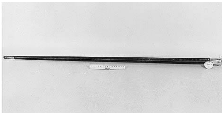
"Presented to Andrew Johnson President of the United States The Restorer of the Constitution." Item held in the collections of the N.C. Museum of History.

Yet the drama had not ended; for Johnson, resisting the mandate by means open and sub rosa, added to the plot. Ouster had been bruited as early as 1866; and after his removal of Secretary of War Edwin McMasters Stanton challenged the Tenure of Office Act, enemies—"Tray, Blanch, Sweetheart, little dogs and all," in Johnsonian parlance—procured in January 1868 impeachment for "high crimes and misdemeanors." The grand assize came in the spring, the Grim Presence comporting himself with dignity in absentia. In crucial roll calls which saw seven "recusant" Republicans side with the Democrats, conviction failed 35–19, one short of the necessary two-thirds. Interpretations of this crisis vary widely. Contemporaries often saw either Radical plot or just retribution. A legalistic approach stresses attack not only upon the man but also upon the presidency; a political persuasion contends that Johnson held a concept of office established only this century—thus, impeachment was a justifiable weapon against encroachment. These are converging polarities, each invoking checks and balances. Yen for power, high crimes, unindictable but impeachable—semantics and hypotheses redolent of Watergate—remind us that the historian is a creature of his or her times.