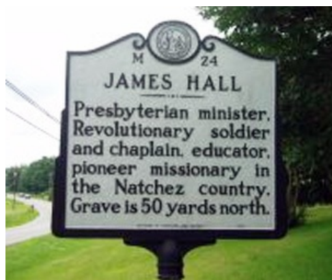
Photograph of the James Hall Highway Marker.