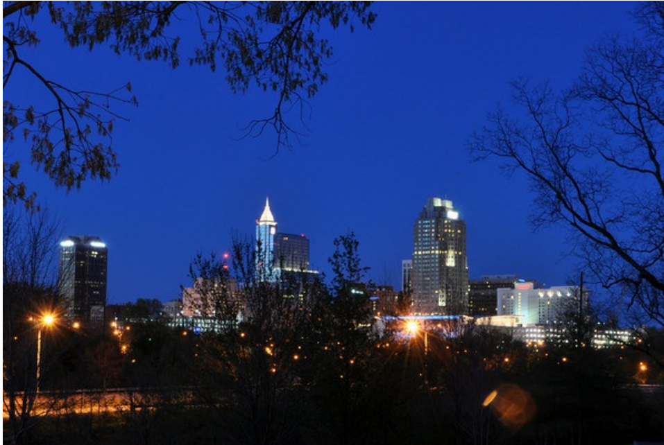
Downtown Raleigh. 406,688 (NC State Data Center)

by Christy E. Allen and Rebecca Hyman, Government & Heritage Library, 2007, 2010; Kelly Agan, Government & Heritage Library, 2018.