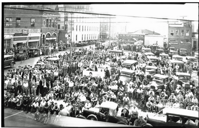
Crowd gathered near intersection of E. Gaston and N. Davie Streets, c.1930.

[36] By the early 20 th century, the Gate City had become one of North Carolina's largest and most important cities, and the boom years of the 1920s saw rapid growth. In 1923, Greensboro annexed enough property to increase its size to almost eighteen square miles and over 45,000 people, making Greensboro North Carolina's third-largest city. The new 17-story Jefferson Building [37] , then the tallest and largest office building in the South, dominated the Greensboro skyline. Insurance became a major industry as Jefferson Standard and Pilot Life grew. In 1927, the downtown area acquired a new railroad station, the Carolina Theatre and the King Cotton Hotel. An airport west of the city increased Greensboro's strength as a transportation hub.