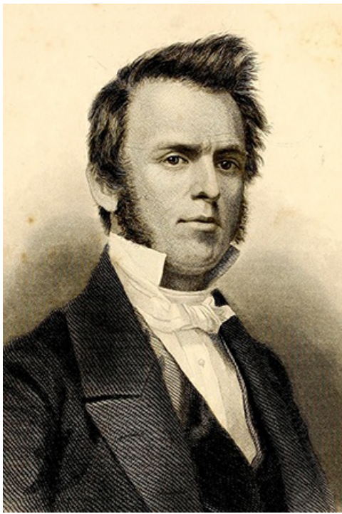
An 1861 engraving of Charles F. Deems.