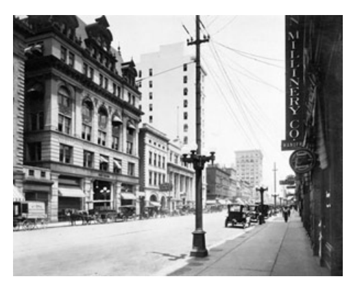
Charlotte, NC. Trade Street looking east, c. 1923

[4]Charlotte is the county seat for Mecklenburg County [5]. Originally home to Native Americans of the Catawba [6] tribe, it was settled by European immigrants about 1750 and established in 1768. The city was named for Queen Charlotte Sophia [7] of Mecklenburg-Strelitz, Germany.