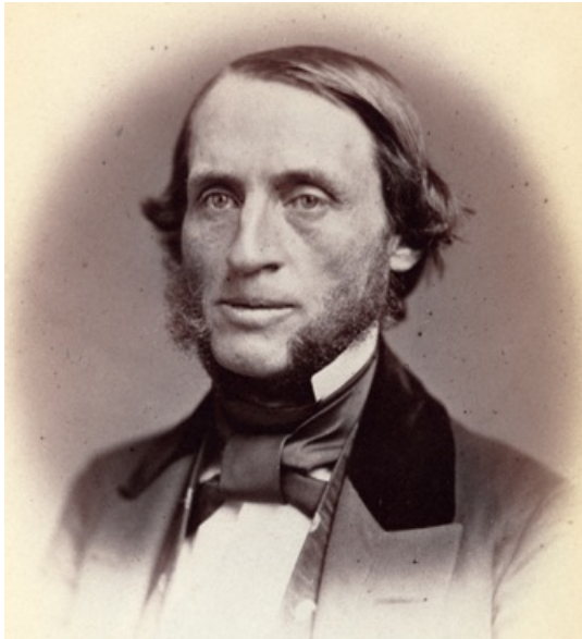
Photograph of Thomas Lanier Clingman, 1859.