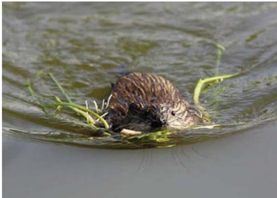
Muskrats require a permanent supply of water and often live in wetland habitats.

Muskrats are abundant in North Carolina and can be legally trapped during open season. Because population densities are high in many areas, muskrats are more easily trapped than most other furbearers. However, the value of their pelts is relatively low.