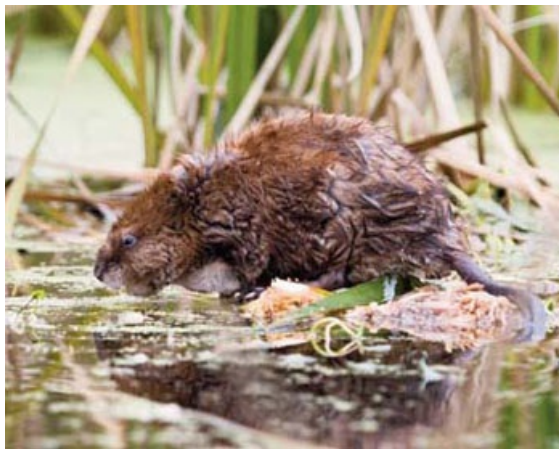
The muskrat lives on riverbanks and in

Muskrats occupy much of the wetlands in the United States, but are absent from Florida and rare in some southern states. Muskrats occupy most of the river systems of North Carolina. They are rare in coastal areas of southeastern North Carolina. Muskrats live in marshy, freshwater areas with a home range of less than a mile.