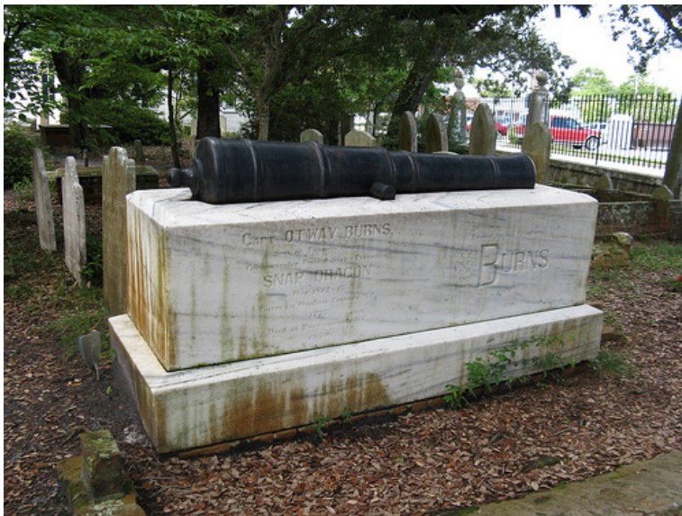
The tomb of Otway Burns at the Old Burying Ground in Beaufort, N.C.