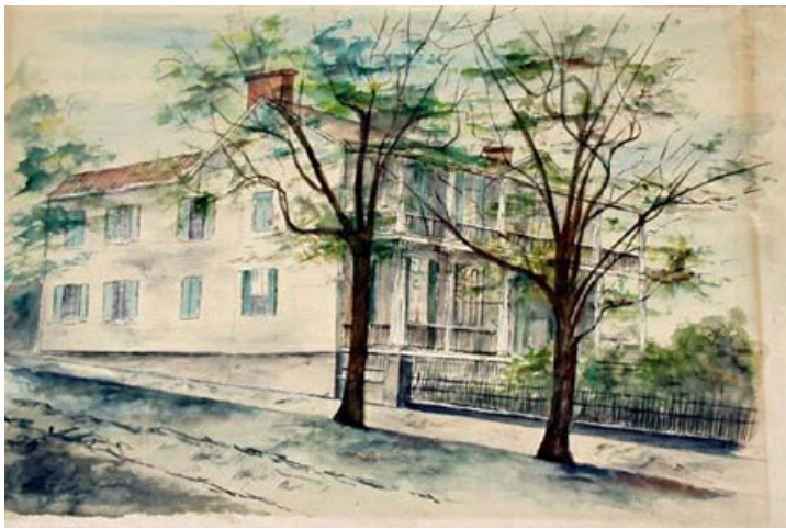
Painting of the Burgwin-Wright House. Image courtesy of the North Carolina Museum of History.

[13] There is little doubt that Burgwin was quite successful in mercantile operations in Wilmington and the Cape Fear region between 1764 and 1775, and New Hanover County records reflect his deep involvement in real estate activities during the same period. By 1771 he was living at Third and Market Street in Wilmington in what was to become one of that city's most famous buildings, today known as the Burgwin-Wright House [14] or Cornwallis House. He also owned Castle Haynes Plantation and the adjoining Hermitage Plantation, both of which he had inherited from his wife, who died on 19 Oct. 1770. In Bladen County he also owned Marsh Castle at Lake Waccamaw.