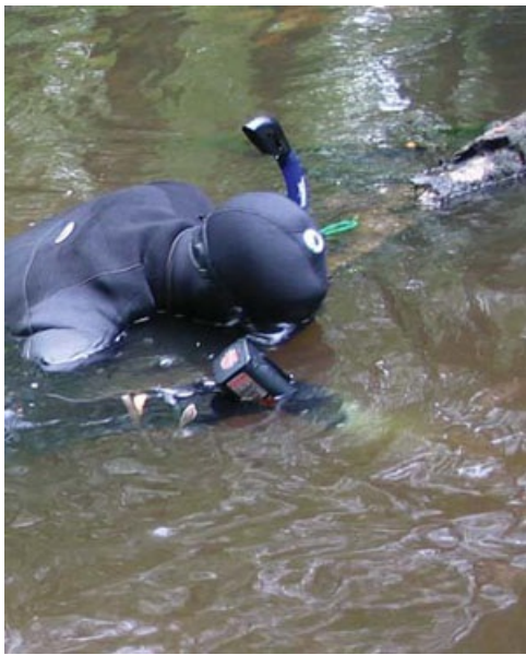
Searching for the Carolina madtom