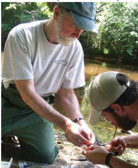
Biologists with NCWRC surveying for Carolina madtom

As a nongame fish with a restricted range, the Carolina madtom rarely interacts with people. Encounters may occur while anglers are collecting bait from streams or rivers. Any observed specimens should not be handled or otherwise disturbed. These fish are imperiled and have specific riverine needs, so no one should attempt