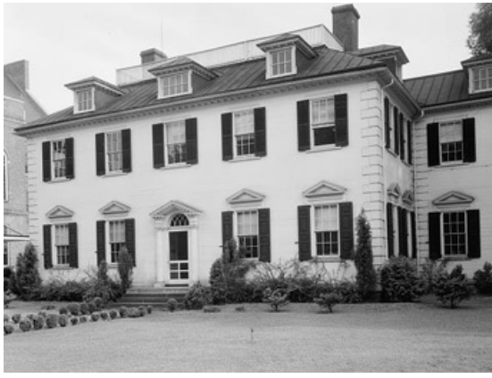
Photograph of the John Wright Stanly House, New Bern, 1936.