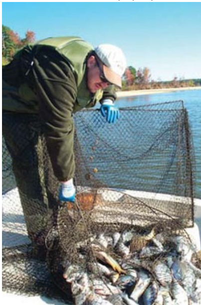
Biologists evaluate crappie populations in many reservoirs and rivers throughout NC. sily caught at night and in the early morning.

Crappie species are most encountered by anglers. Fishing for crappies is very popular in North Carolina, and fishermen consider crappies to be excellent sportfish. They can be caught on a variety of fishing equipment including cane poles, spinning and bait-casting outfits, fly rods and ice-fishing gear. Anglers usually try to locate a school of crappies and fish for them using minnows, small jigs or a combination of the two. Care is required when setting the hook or when landing the fish because its soft papery mouth tears easily, allowing hooks to pull out. Crappie species are most active and ea