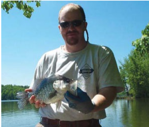
Crappie are among the most fished-for People Interactiospecies in North Carolina. ns

The black crappie grows slower than white crappie, but because of its stockiness, a black crappie will weigh more than a white crappie of similar size. The rate of growth depends on habitat, food availability and crappie population size for a given body of water. Too many crappies and not enough food results in slow growth or stunting. The tremendous reproductive capability of crappie species often results in stunting, particularly in small ponds.