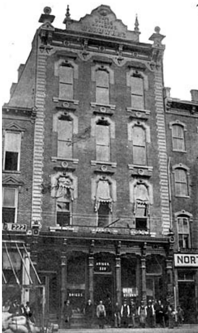
Briggs Hardware Building, from NC Office of Archives and History.