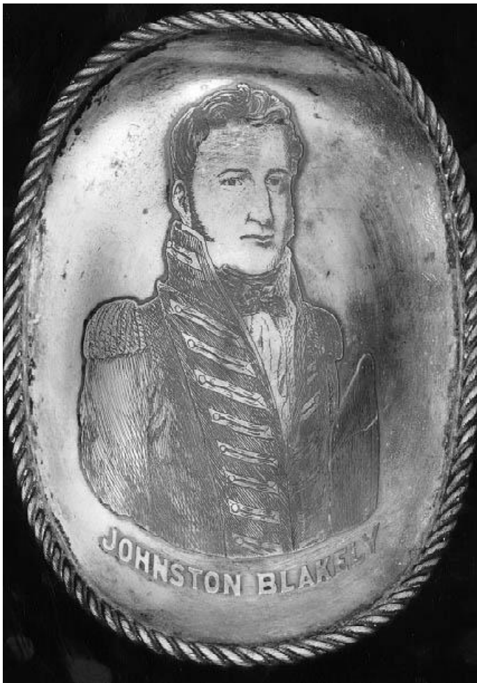
Engraving of Johnston Blakeley.