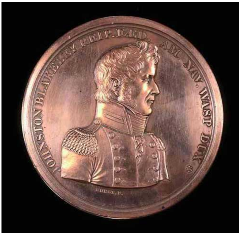
Commemorative Medal in honor of Johnston Blakeley. North Carolina Museum of History.