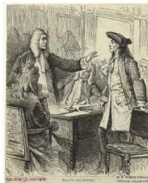
Granville and Archdale, 1706.

In July 1694, Thomas Smith, governor of the southern part of Carolina, requested that the proprietors send out a new governor with full powers to deal with the unrest and dissension among the colonists. The proprietors commissioned Archdale governor of both halves of Carolina, and he made a tour of the English colonies on his way to assume the government of the proprietary. He landed in Maine early in 1695 and traveled south, visiting every colony en route to Charleston, which he reached in August 1695. Once in Charleston he set about "to allay the heates" of the people, to moderate the differences between Dissenters [12] and Churchmen, and to choose a council and call an assembly. At