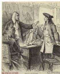
Granville and Archdale, 1706.