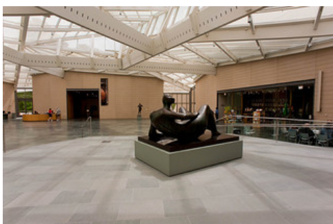
Nasher Museum of Art, Durham, NC, 2010.