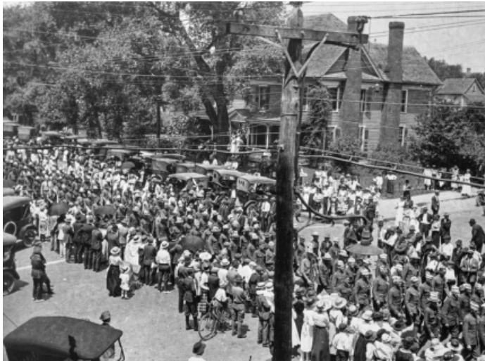
An Armistice Day parade in Statesville, 1920.