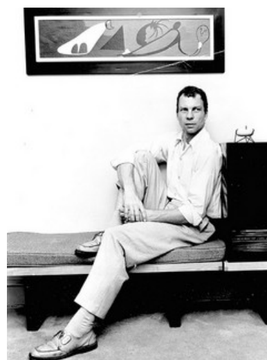
Merce Cunningham, Black Mountain College 1953 Summer Institute in the Arts.

Part 1: Introduction [13] ; Part 2: Early North Carolina Painting and Portraiture [14] ; Part 3: A Growing Artistic Community in the State [15] ; Part 4: Producing and Teaching Art in North Carolina Colleges and Universities [16] ; Part 5: The Evolution of Photography [16] ; Part 6: North Carolina Art Museums, Exhibits, and Centers [17]