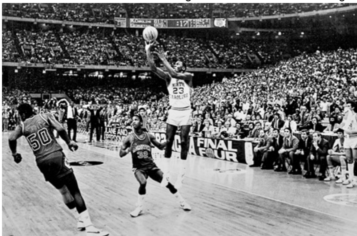
Michael Jordan, as a UNC freshman, launches the winning shot against the Georgetown Hoyas in the 1982 NCAA championship game in New Orleans. Raleigh

professional basketball grows longer by the year. News and Observer.