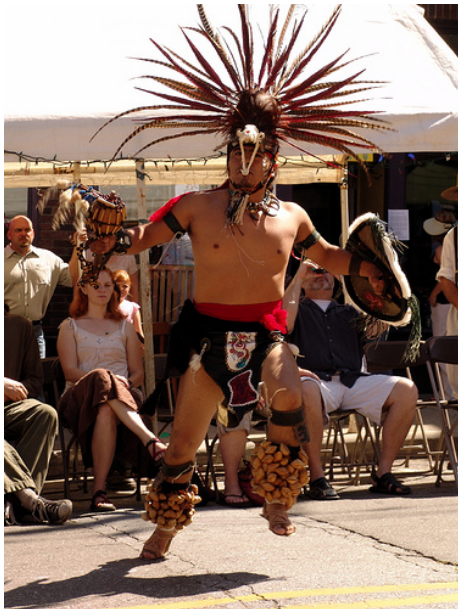
Aztec Dancer as Lexington Avenue Arts Fun Festival. Asheville, NC.

[18] North Carolina's increasing ethnic and cultural diversity has spawned numerous festivals to promote understanding and community among peoples. Many festivals are held by Native American [19] groups to highlight both traditional and contemporary expressions of Indian culture, including music, drumming, food, and crafts. Since 1996, the Occaneechi [20] - Saponi [21] Cultural Festival has been held annually on the banks of the Eno River [22] in Orange County [23] . It features handmade tribal crafts, dancing, food, and music to raise money and awareness for the preservation of Native American history. Festivals and powwows are also sponsored by the Cherokee [24] , Waccamaw [25] - Siouan , Meherrin [26] , Lumbee [27] , and other tribes in the state. For nine days annually in late June and early July, the Lumbee celebrates Lumbee Homecoming [28] with pageants, sports, gospel singing, an elder's dinner, art shows, and other events. While rooted in a celebration of kinship and community ties, it has also become an opportunity to showcase the causes of tribal recognition and Native American sovereignty.