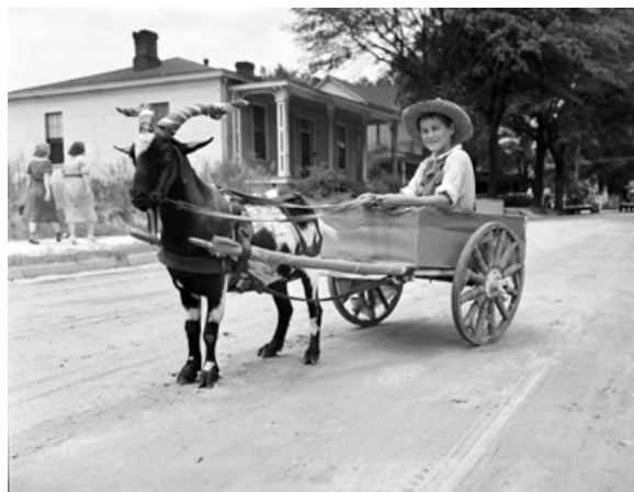
Wilson Farm Festival, Wilson, NC, August 1938, Goat Wagon, photo taken by Baker. Conservation and Development Department, Travel and Tourism Division Photo Files, North Carolina State Archives, call #: ConDev1403A-A .

Folk Festivals - Part 1: Introduction [14] ; Folk Festivals - Part 2: Original Folk Festivals and Contemporary Gatherings [15] ; Folk Festivals - Part 3: Ethnic and Holiday Festivals [16] ; Folk Festivals - Part 4: Music and Food Festivals [17] ; Folk Festivals - Part 5: References [18]