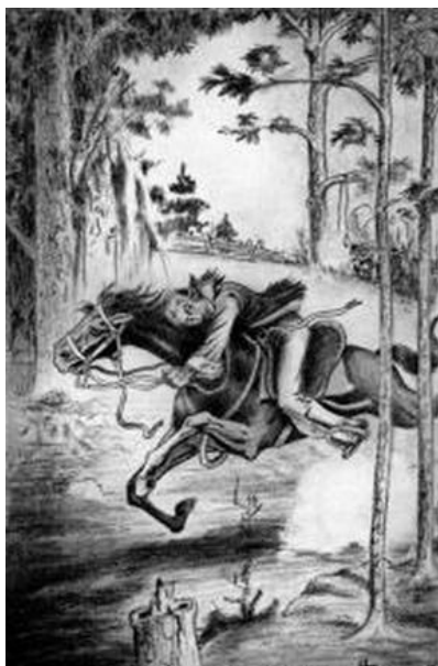
David Fanning, a notorious North Carolina Loyalist.

Part 1: Introduction [8] ; Part 2: Loyalists' Role in the War [9] ; Part 3: African American Loyalists [10] ; Part 4: Loyalist Fate at War's End ; Part 5: References [11]