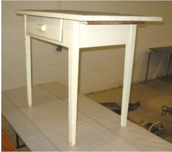
Small white-painted rectangular wooden utility table, 1880-1950. Mount Airy, North Carolina

By 1900 there were 44 furniture factories in High Point and the surrounding towns of Thomasville, Lexington, Salem, Marion, Mount Airy, Statesville, Hickory, and Greensboro. The central location of the Piedmont made High Point a natural shipping point for southern markets that desired inexpensive, well-made furniture. The industry was also given a boost when several national mail-order companies, including Sears, Roebuck & Co [20] , purchased large lots of North Carolina furniture to market nationwide through their catalogs. Other allied manufacturers set up factories in High Point to provide veneers, plate glass, mirrors, paint, and locks to the furniture companies.