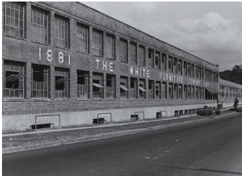
White Furniture Company factory, Mebane, North Carolina