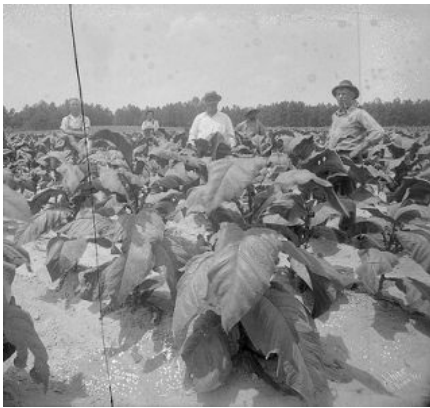
Group in tobacco field, no date (c.1920's-'30's).

Part i: Introduction ; Part ii: Development and Growth of the North Carolina Tobacco Industry [12] ; Part iii: The Rise of "Big Tobacco" [13] ; Part iv: Legal Challenges and the Decline of the Industry [14] ; Part v: References [15]