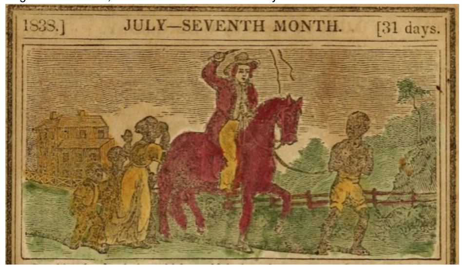
Slaves under the overseer's whip, illustration from the American Antislavery Almananc, 1838.

traveler observed: "The keep of a negro here does not come to a great figure, since the daily ration is but a quart of maize, and rarely a little meat or salted fish." Schoepf also reported that each year an enslaved man received "a suit of coarse woolen cloth, two rough shirts, and a pair of shoes." Conditions had scarcely improved during the antebellum period. Enslaved people supplemented their owner-supplied diet of cornmeal and fat pork by hunting, fishing, and raising vegetable gardens. Dark, smoky, and crowded, cabins for enslaved people were insubstantial structures with dirt floors, unglazed windows, and wattle-and-daub chimneys.