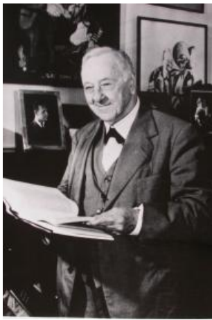
Josephus Daniels, editor of the N&O.