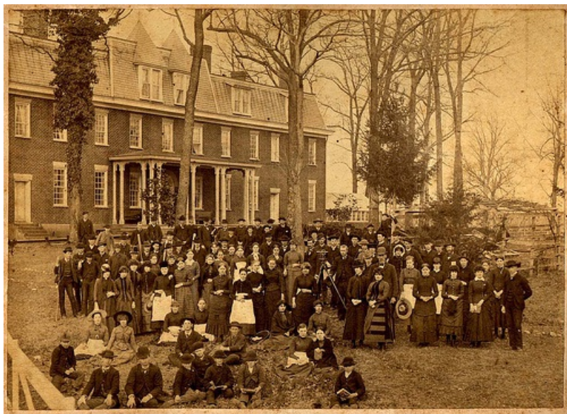
Faculty and staff, New Garden Boarding School, 1886.

Regulation and continued into the American Revolution [14] . The pacifist Quakers were particularly affected by the military operations and the protracted violence of the internal conflict between the Whigs and Loyalists. The key factor, however, in the diaspora of southern Quakers was their witness against slavery, which began in the late eighteenth century and intensified in the nineteenth century. Quakers organized manumission and African colonization societies and gradually began to advocate abolition of slavery. Levi Coffin [4] of Guilford County was a founder of the Underground Railroad [15] , which enabled thousands of slaves to escape to freedom. The southern community met the Quaker antislavery stance with escalating hostility, precipitating mass migrations of Quakers to the free states of Ohio and Indiana.