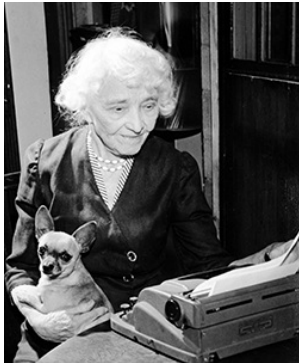
Olive Tilford Dargan (1869-1968).