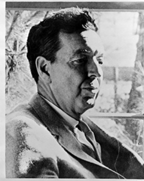
Randall Jarrell (1914-1965).

Randall Jarrell [37] (1914-65) attended Vanderbilt University and studied under southern literary magnate Robert Penn Warren. After graduation he eventually settled in