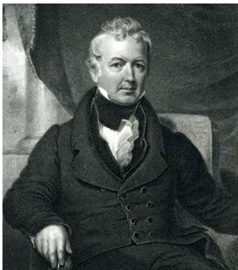
Lithograph print of William Gaston.